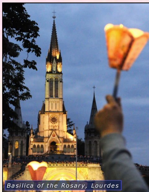
Basilica of the Rosary, Lourdes