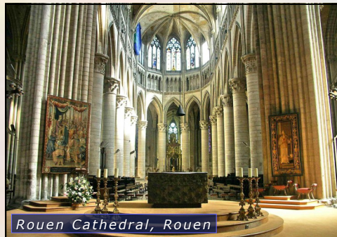
Rouen Cathedral, Rouen