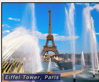
Eiffel Tower, Paris