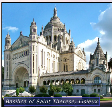
Basilica of Saint Therese, Lisieux