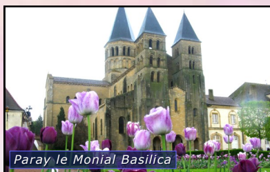
Paray le Monial Basilica